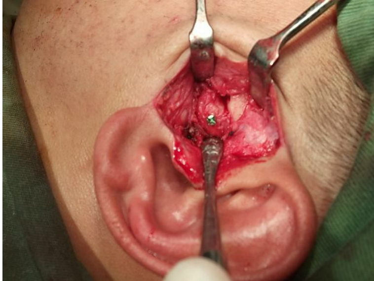
Figure (1): Mini-screw anchor placed the on the most posterior, superior, and lateral aspects of the mandibular condyle.