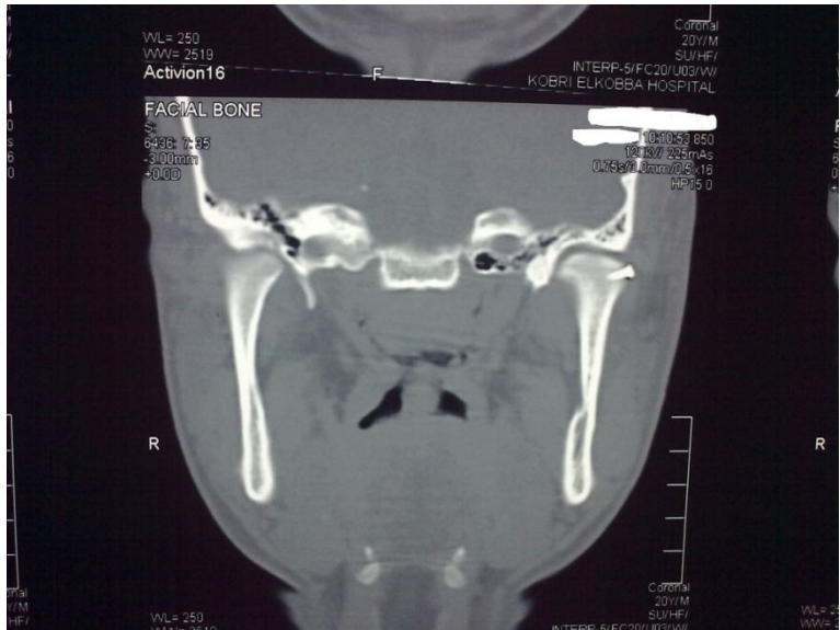
Figure (3): Postoperative CT.